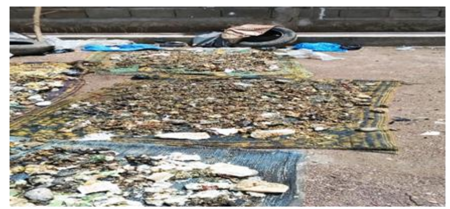
Fig. 3: food scraps recovered from the Badalabougou site

However, we noticed that some reclaimers were feeding on out-of-date and/or expired canned goods. The photo below shows food scraps (bread, rice, etc.) spread out on old plastic mats for drying