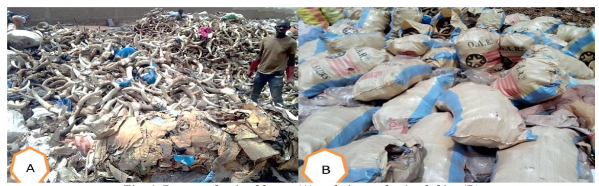
Fig. 6: Recovered animal horns (A) and pieces of animal skins (B)

Nigeria and Ghana. These entrepreneurs recover horns and skins, which they transform into feed for captive-bred fish (Fig. 6).