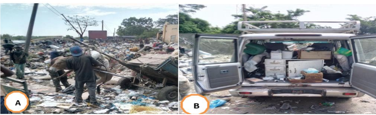
Fig. 7: A donkey in difficulty (A) and a vehicle belonging to an NGO that cares for donkeys (B)

International NGOs such as SPANA-Mali, whose mission is to protect draught animals, provide medical care and follow-up for the animals used to transport household waste to landfill sites (Fig. 6 - B).