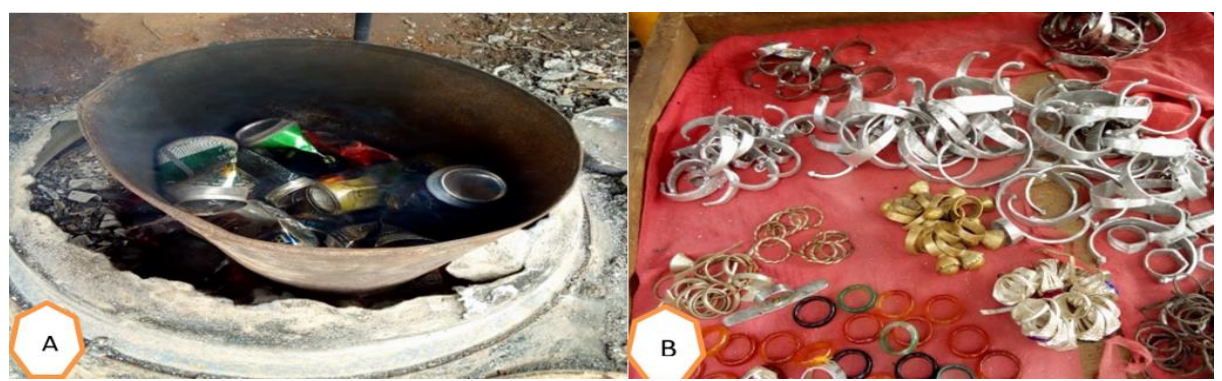
Fig.5: Device for melting beverage cans (A) and jewelry made from recycled objects (B)

In Bamako, to make their investment profitable, some Chinese have preferred to set up local recycling factories that manufacture concrete reinforcing bars from recycled iron items.