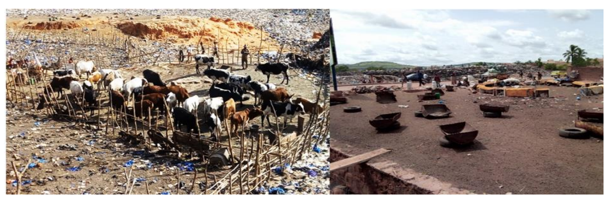
Fig. 8: Animals in enclosures on landfill sites

The animals often stayed in their enclosures, where they received scraps of salvaged food. Sometimes, shepherds would walk them around the dumps during the day and bring them back to their pens in the afternoons. On landfill sites, animals can consume more plastics than anywhere else.