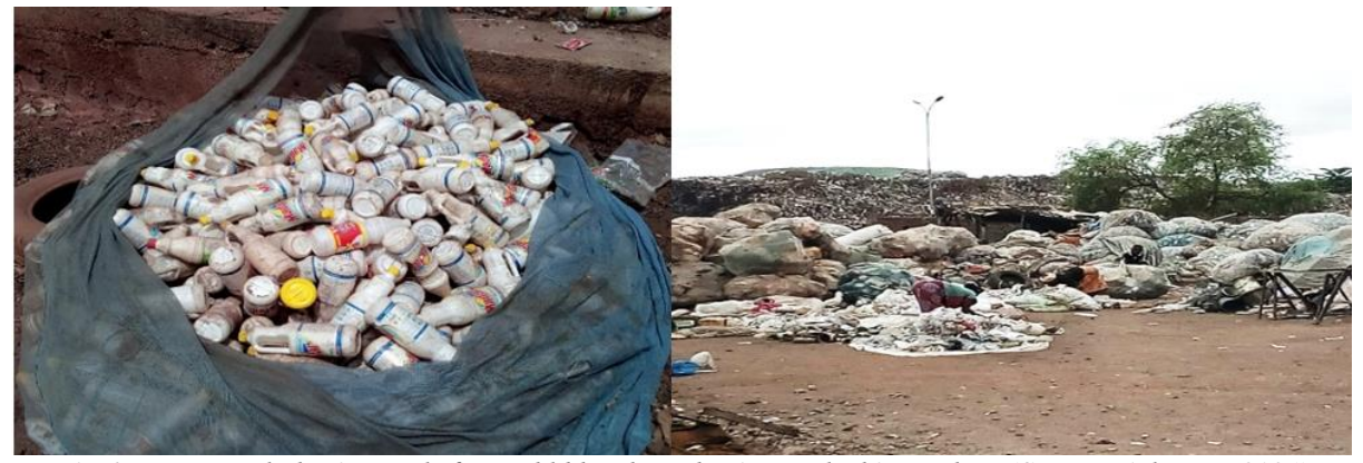
Fig.4.: Recovered plastics made from old bleach packaging and white sachets

Recycling was based on an "open" cycle. The cleanliness of a recovered object was often one of the factors that guaranteed its good quality to buyers. To this end, women did not hesitate to soak them in any kind of water to rid them of sand and other impurities, at the risk of being infested by microbes from unhealthy waters.