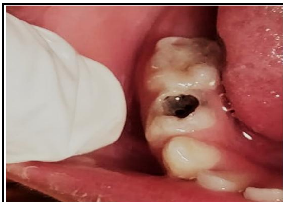
Figure 4: SDF application