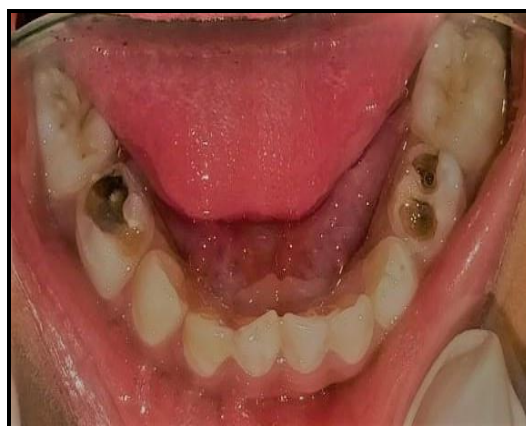
Figure 1 : Pre treatment intraoral photographs