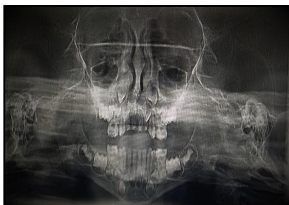
Figure 2: pre treatment OPG

The radiographic evaluation stated that there was absence of any pathological defects in the periapical area. The OPG did not showed any evidence of the defect in periodontal ligament space and alveolar bone. The radiological diagnosis stated that there was pulpal involvement of 51,52,61, 62,54,64.(Figure 2) Medical history was non-contributory. Also there was no significant history of parafunctional habit or bruxism. The complete treatment plan included silver diamond fluoride application