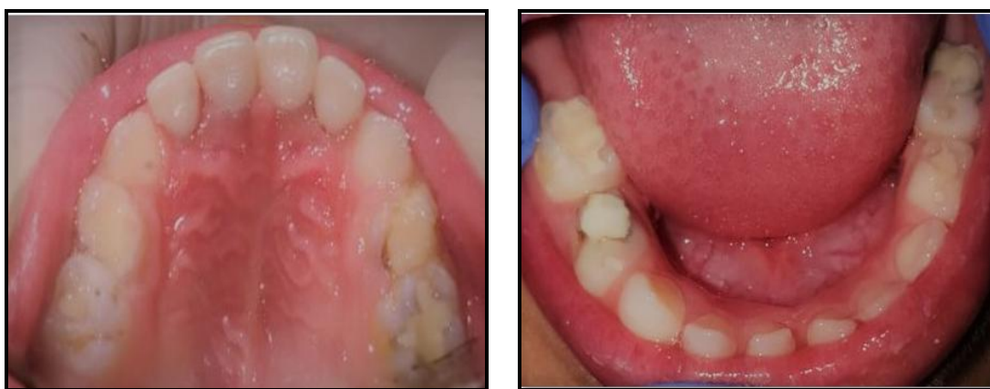
Figure 6: Post treatment after 3 months intraoral photograph

Marginal fit of the crowns was evaluated, after that the zirconia crowns were cemented with light cure resin cement (Rely X/3M ESPE) and were held with firm consistent pressure on the teeth at proper position till the initial set. The occlusion was checked and removal of interferences and shape modification required was done with high speed diamond bur. (Figure 5) The child and parents were instructed about the importance of oral hygiene and diet. They were also motivated to maintain regular recall appointments every 3 months. (Figure 6)