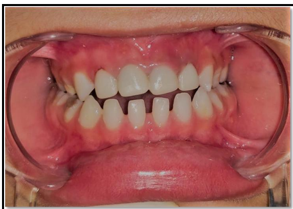
Figure 5 : Zirconia crowns irt 51,52,61,62; Post treatment intraoral photographs

At next visit, the pulp therapy was initiated irt 51,61,62,64 and caries excavation was done followed by 38% of SDF application irt 74,75,65 and GIC restoration. Third visit treatment, the cleaning and shaping and obturation was done using Endoflas using lentulospirals in relation to 51,61,62,64. (Figure 3) Pulp therapy was initiated in relation to 54 and caries excavation was done followed by 38% of SDF application irt 84,55. (Figure 4) Indirect pulp capping using Dycal application was done irt 85.