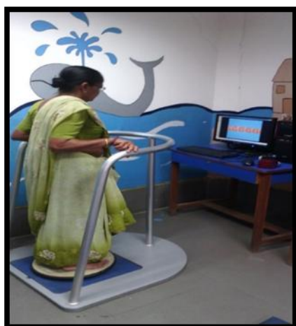
Photograph – 6