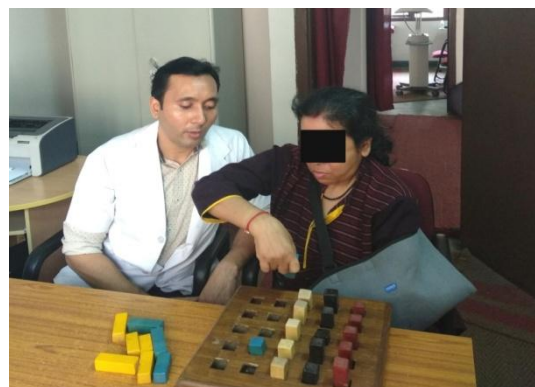
Fig. 1: Group A patient receiving forced used technique

Exercises and Active Exercises with, including Capsular stretching