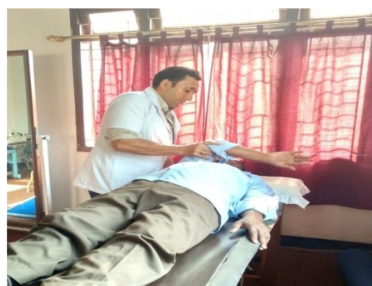
Fig. 2: Group B patient receiving Capsular stretching